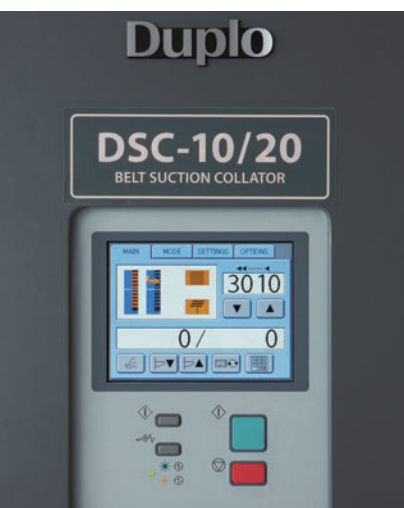
Colour touch screen

The DSC-10/20 collator can connect to a number of bookletmakers making it very easy to upgrade the system should the business's demands grow.