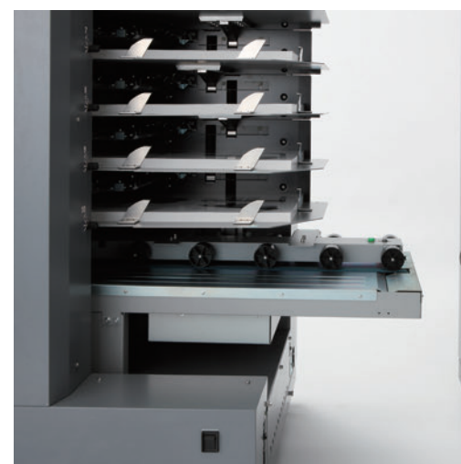
Optional bridge unit